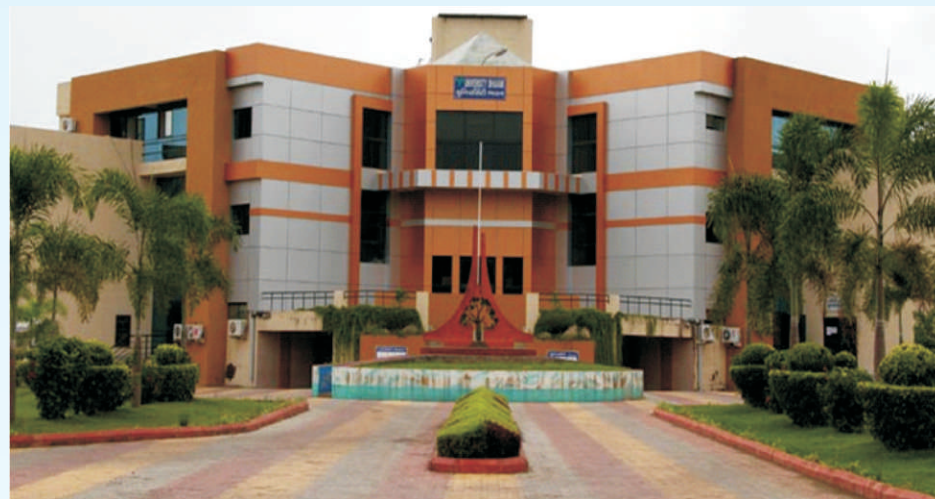
Navsari Agricultural University, Navsari Campus Administrative Building.

Course Coordinator and Assistant Professor Department of Horticulture, College of Agriculture, N.A.U., Campus Bharuch - 392 012 (Gujarat) Tel: +91 2642-246152 (O) Mob: +91 99781 31540