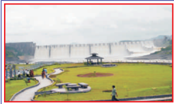
The water fall of Narmada Dam.