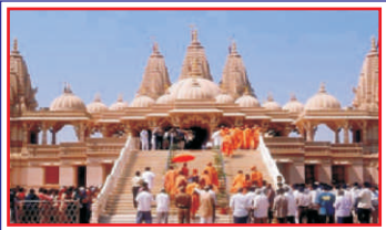
The Swami Narayan Temple.

Bharuch formerly known as Broach is a city at the mouth of the holy river Narmada in Gujarat in western India. Bharuch is second old city of India and first old city of Gujarat state. Bharuch is the administrative headquarters of Bharuch District and is a municipality of about 370,000 inhabitants. Being one of the biggest industrial areas including Ankleshwar GIDC, it is at times referred as the chemical capital of India.