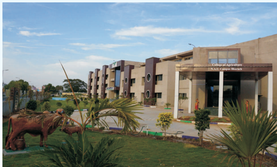
College of Agriculture, N.A.U., Campus Bharuch, Dist. Bharuch-392 012